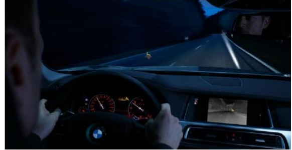
Vehicles in market with night vision system

It has been found out that neither of the technologies has a clear advantage. But, not everyone thinks night vision in cars makes sense. The biggest problem with night vision is that these systems demand that the driver take his/her focus from the road, which is not a good idea, and drivers will just increase their speed, believing themselves to be less at risk, so to avoid this problem the driver is given an automatic warning of the approaching object and thus he doesn't have to look every time on the monitor to check for vehicles and he can completely concentrate on the road while driving. Effective algorithms are required in order to send a warning to the driver fast enough if a pedestrian is detected. [3]