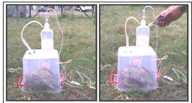
Figure 2: Experimental Setup Flux Box