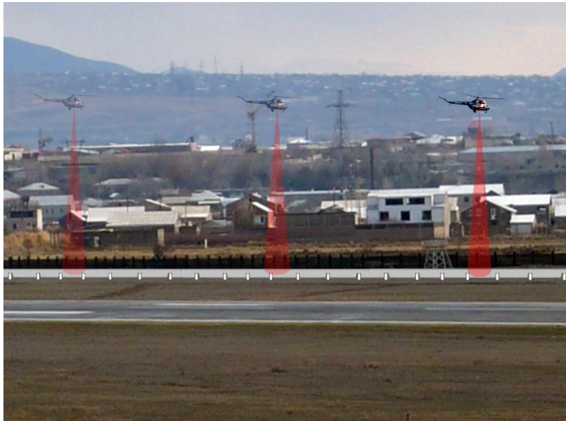
Fig. 4. Helicopter IR scanning of GMPs.

of 2.5 to 5.5 \mu\text{m} ) considerably increases that is registered by the electronic control unit.