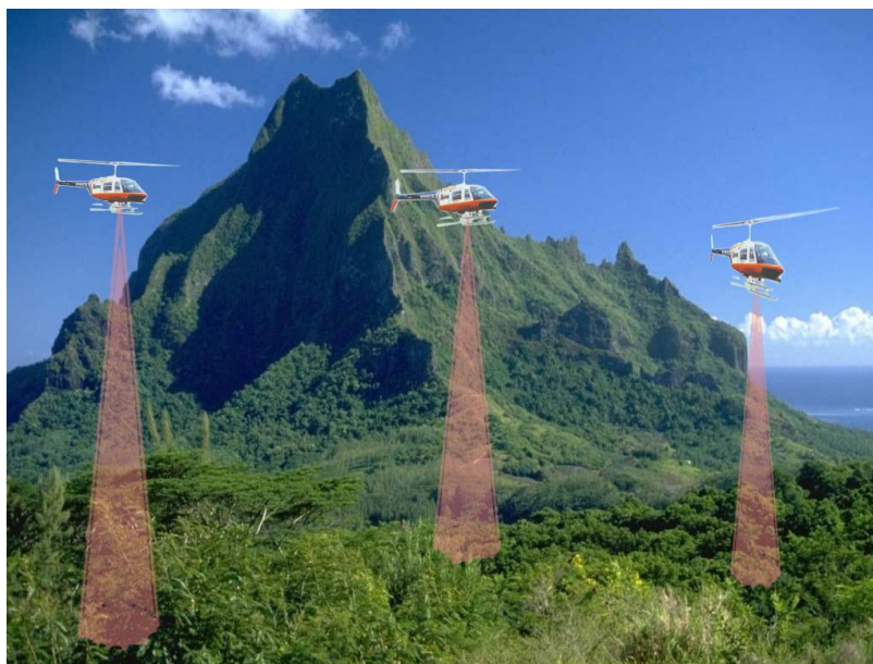
Fig. 3. Helicopter IR scanning of large forests.

The IR radiometer is mounted in the helicopter and, with the help of a deflecting plane mirror, by its field of vision scans (through the bottom hatch, along the helicopter motion routing) terrestrial surface of large forests, see Fig.3.