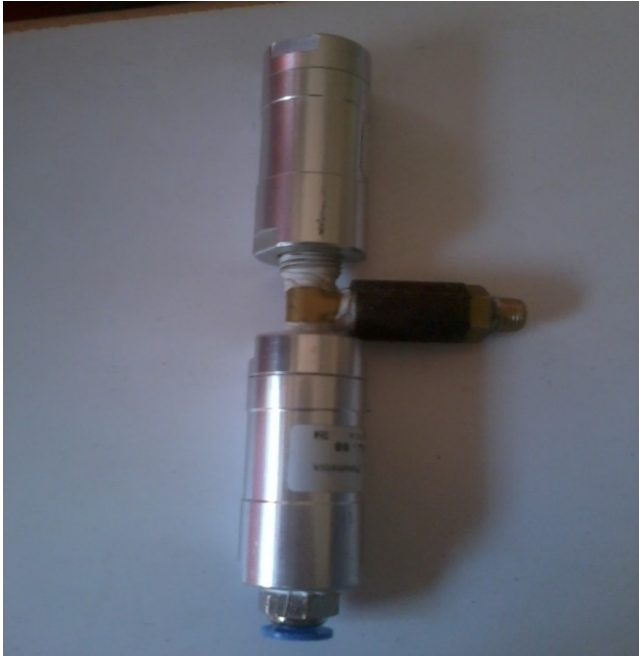
Fig.4: Non Return valve