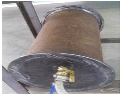
Fig.2: Air Tank

Air tank is used to store pressurize compressed air and supply this pressurize air for various use when required.