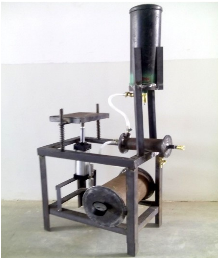
Fig.2: AC System by Using Vehicle Suspension

When the shock absorber is operated the spring get compressed this pushing energy is send to pneumatic piston and cylinder which compresses the air taken from surrounding.