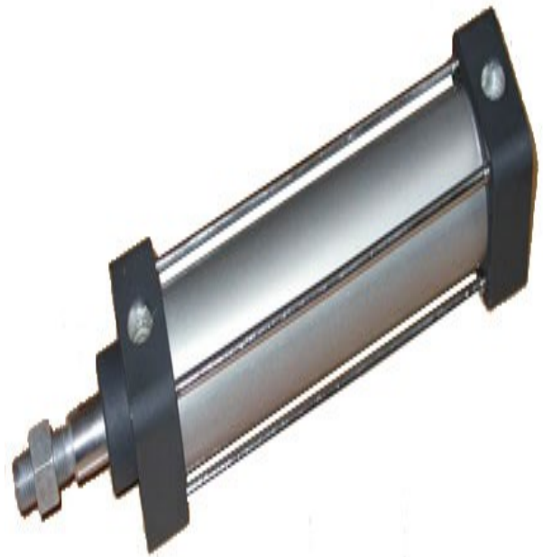
Fig.3: Pneumatic Cylinder

When the shock absorber is operated the spring get compressed this pushing energy is send to pneumatic piston and cylinder which compresses the air taken from surrounding.