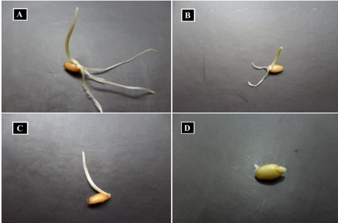
Fig-1: The pictures of germinated (A and B) and non-germinated (C and D) of some seeds.

In some seeds, the radicle has not observed on germination of second imbibition because it had emerged in the first imbibition and then died. Those seeds had only coleoptile and seminal roots, and so they were also counted as germinated (Fig-1:B). If the seeds did not have collectively coleoptiles and seminal roots (Fig-1:C) or no one (Fig-1:D), they were considered as non-germinated. In the cases where germination was observed, germination rate (GR) was calculated by following formula;