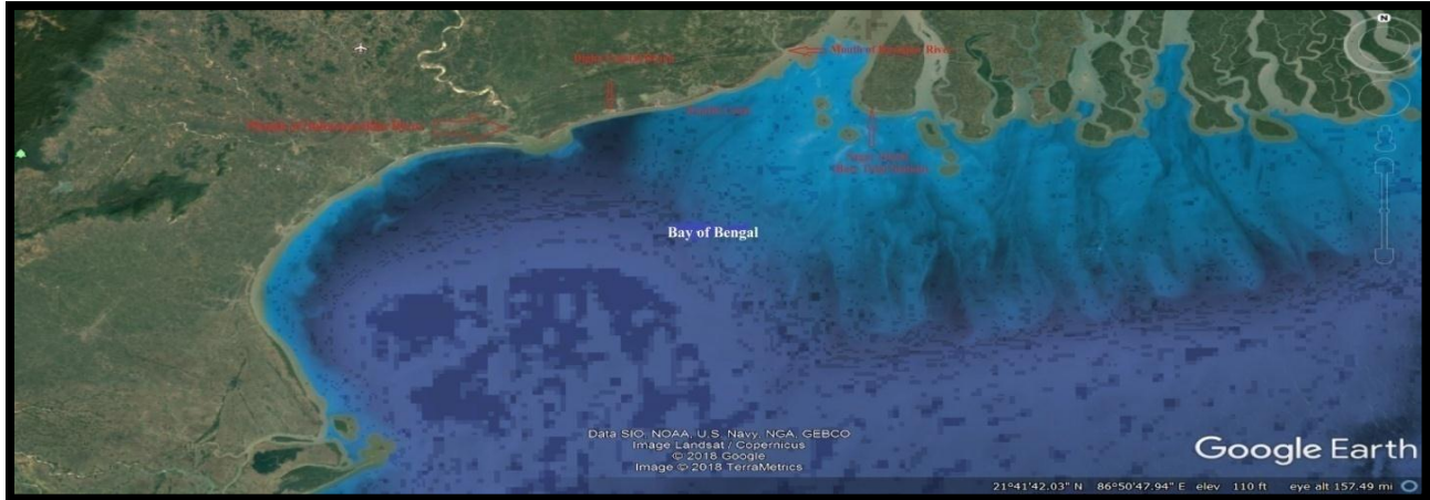
Figure 1: Kanthi Coastal Beach (Dey and Shukla, February 2019)