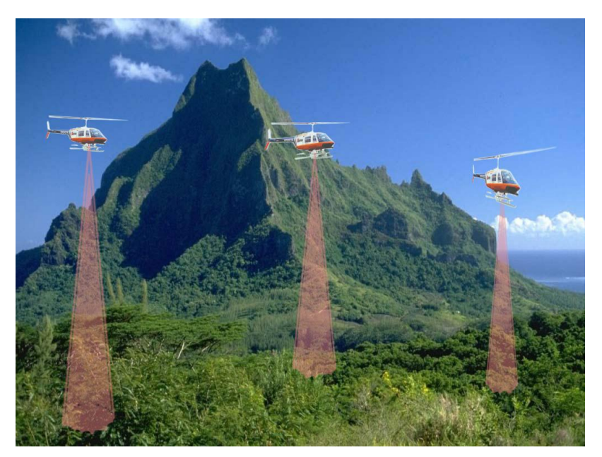
Fig. 3. Helicopter IR scanning of large forests.

The IR radiometer is mounted in the helicopter and, with the help of a deflecting plane mirror, by its field of vision scans (through the bottom hatch, along the helicopter motion ruoting) terrestril surface of large forests, see Fig.3.