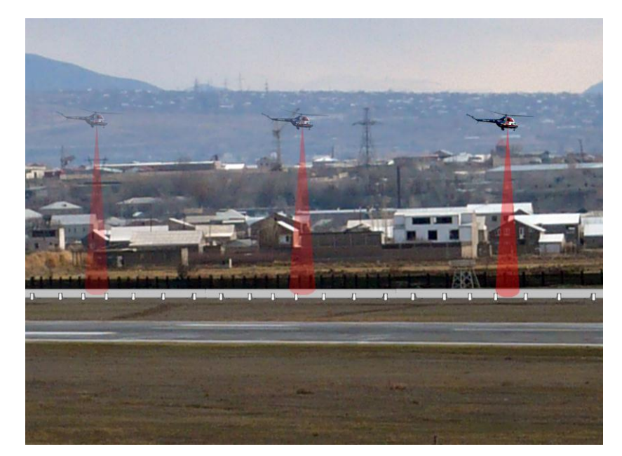
Fig. 4. Helicopter IR scanning of GMPs.

of 2.5 to 5.5 \mu m) considerably increases that is registered by the electronic control unit.