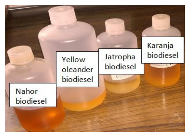
Fig. 4 Biodiesel produced from the non-edible oil feedstock

Another important factor in biodiesel production is the selection of catalyst. Renewable heterogeneous catalyst is desirable as they are naturally available and non-toxic. The use of Egg shell as catalyst for biodiesel production is in progress in recent times. This study may prove to be beneficial in terms of using this catalyst in various non-edible oils from north-east India. The biodiesels produced using egg shell as catalyst has been shown in the fig.4 and the fuel properties are given in the table II.