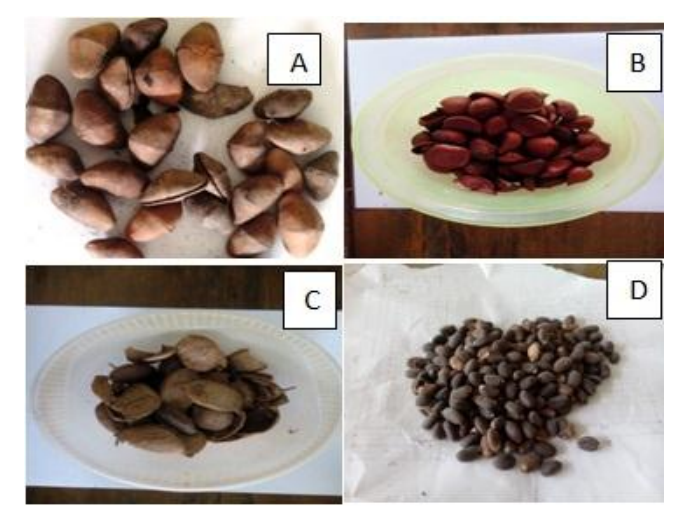
Fig.1 A: Yellow oleander B: Nahor C: Karanja and D: Jatropha seeds

Soxhlet apparatus, rotary vacuum evaporator, heating mantle, hexane, various oil bearing seeds such as Yellow oleander ( Thevetia peruviana ), Nahor ( Mesua ferrea ), Karanja ( Pongamia pinnata ) and Jatropha ( Jatropha curcas ) were collected from different localities of Assam. Jatropha curcas and Pongamia pinnata seeds were supplied by Kaliabor Nursery, Nagaon (Assam).