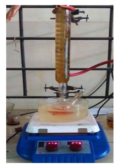
Fig.3 Experimental setup for transesterification reaction