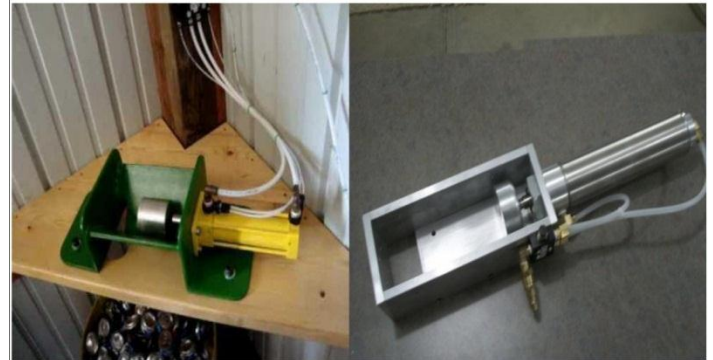
Fig.4: Pneumatic single can crushers

Multiple can crushers provide an advantage over single can crushers that many cans can be crushed without the need to remove crushed can as they fall automatically due to gravity. But the problem faced is application of high force at lever due to lesser mechanical advantage.