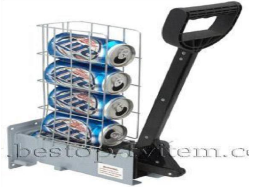
Fig.3: Manual multiple can crusher

Multiple can crushers provide an advantage over single can crushers that many cans can be crushed without the need to remove crushed can as they fall automatically due to gravity. But the problem faced is application of high force at lever due to lesser mechanical advantage.