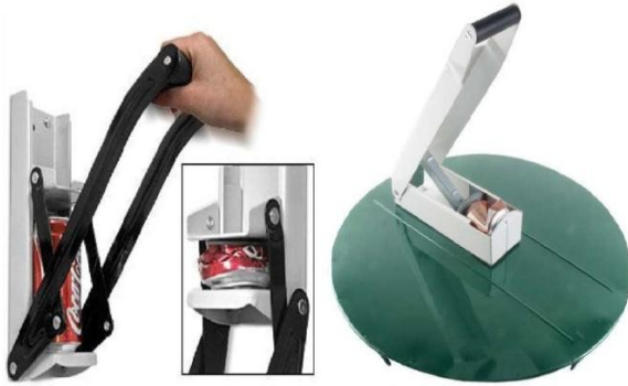
Fig.2: Manual single can crushers

The most common types of crusher these days are basically used for volume reduction. The design of these types enable them to crush follow the types of crusher and then crush as look as possible or destroy.