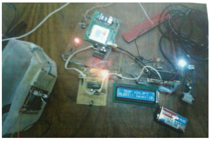
Figure 3: Hardware