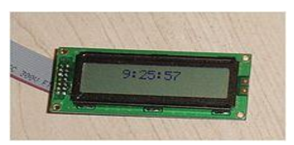
Figure 5: diagram of LCD

Hitachi HD44780 LCD (liquid crystal display) controller. Hitachi organized the microcontroller to drive LCD display with interface which is connected to microprocessor or microcontroller. This device can show result in ASCII characters.