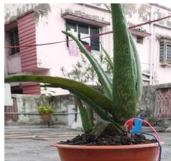
Fig.1. Plat System

Being a succulent, Aloe Vera retains soil moisture for extended periods and continuously releases root exudates (organic acids, sugars, and ions) into the rhizosphere. These factors increase soil conductivity, creating a favourable environment for galvanic reactions. A healthy Aloe Vera plant approximately 15–20 cm tall was chosen and housed in a 20 cm terracotta pot containing commercially available potting soil. The potting medium was selected for its balanced texture and good drainage, preventing waterlogging while maintaining adequate ionic mobility.