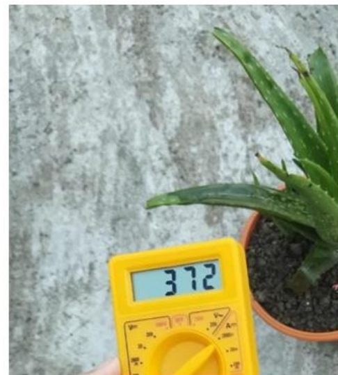
Fig.3 Current reading by using multimeter