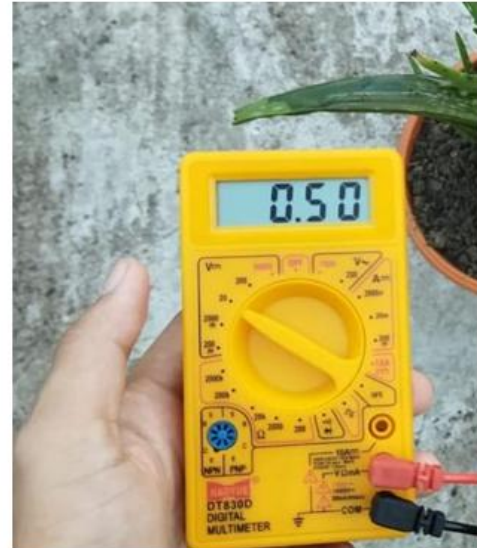
Fig.2 Voltage reading by using multimeter

Immediately after inserting the electrodes into the soil, the multimeter was connected and left undisturbed. The voltage and current readings shown on the multimeter display were recorded every 30 minutes for the first two hours. This step was done to observe whether the readings became stable over time and to ensure the system was working consistently before continuing with further measurements.